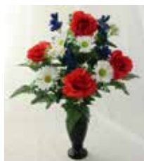
*Red, White & Blue*